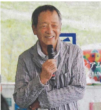
Susumu Shingu talking about his creation

Shingu is known for his works that are powered by natural forces such as wind and water, and his works are installed around the world, including skyscrapers in New York, the National Opera Theater in Greece, a port in Italy, and the luxury brand “Hermes” in Ginza, Tokyo.